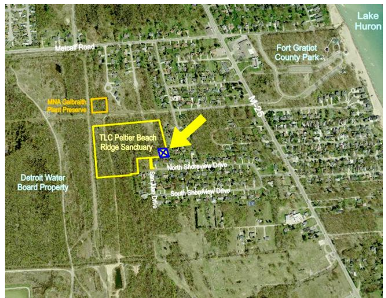
0.23-acre Peltier Beach Ridge Sanctuary addition.

still about $500 short of the total needed. Last I spoke with Bob, he said no rush, but we probably should finalize this soon. Thanks to those who have donated.