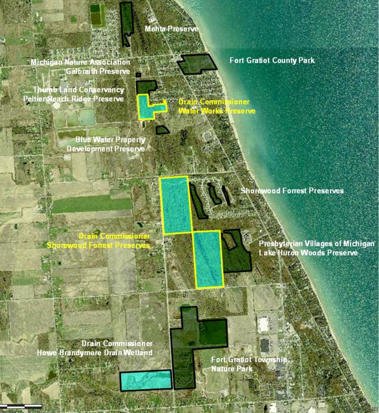
Fort Gratiot Township