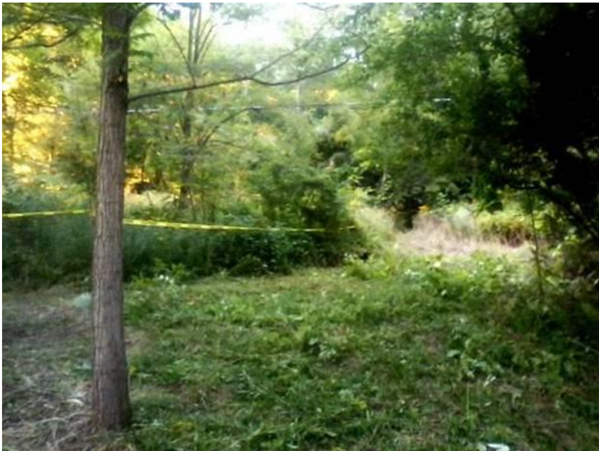
View north of the trail entrance north of Metcalf Road.

Please excuse the quality of these photographs. They were taken near dark after a day of working on the trail.