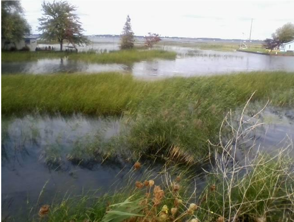
Part of a vast expanse of wild-rice along the south side of Little Muscamoot Bay.