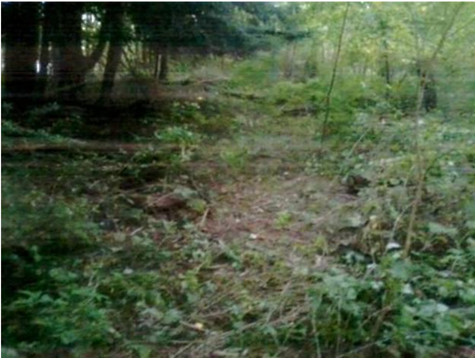
View south of the trail passing by large Eastern Hemlock trees to the left.