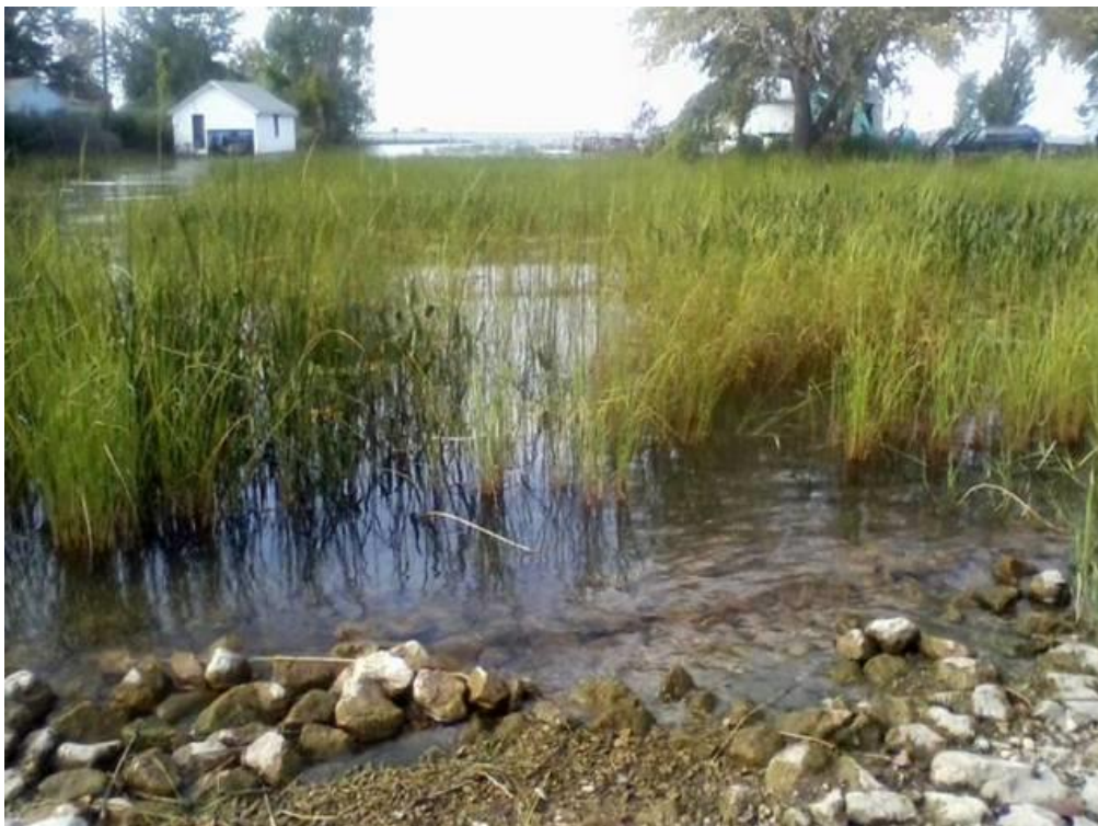
Wild-rice appears to be increasing all over Harsens Island, like this patch only about 15 feet north of South Channel Drive.