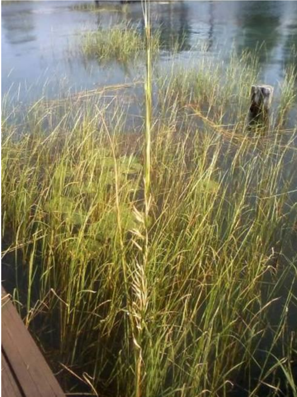
A wild-rice plant showing seeds tight against the stalk above and pendant male flowers below. In the background is a patch of wild-rice in varied stages of seed development.