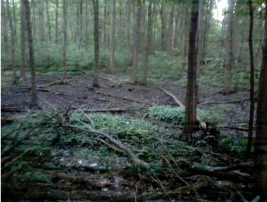
View east of the big wetland swale from the adjoining beach ridge.