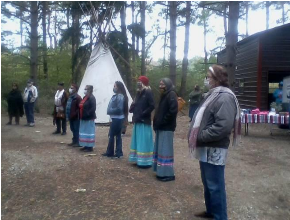
Participants stood in a large half-circle for the naming ceremony.